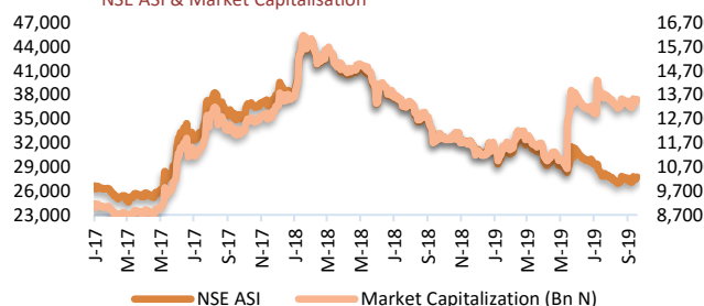
NSE ASI & Market Capitalisation

The Nigerian equities market waned by 45bps amid profit taking activities in spite of the bulls outnumbering the bears (17 gainers as against 16 losers) at the sound of the trading gong. On a year-to-date basis, the negative performance of the ASI extended to 14.52% from 14.14%. Bellwethers such as UBA, NESTLE and SEPLAT decreased by 1.63%, 2.03% and 6.85% respectively, pulling the NSE Banking, NSE Consumer Goods and NSE Oil & Gas sectorial indices down by 0.13%, 1.18% and 4.18% respectively. Elsewhere, the total volume of equities traded increased by 9.24% to 151.71 million units while the total naira votes surged by 45.56% to N1.50 billion. Meanwhile, NIBOR dipped for most tenure buckets amid sustained ease in the financial system liquidity; similarly, NITTY fell for most maturities tracked on sustained bullish activity in the secondary treasury bills market. In the bonds market, the values of OTC FGN papers fell for most maturities tracked; however, FGN Eurobond prices rebounded for most maturities tracked.